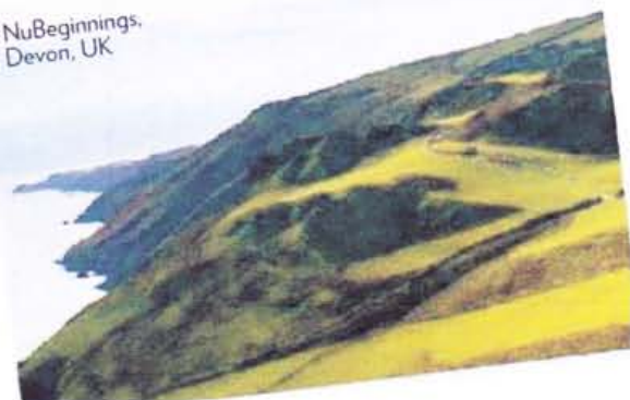
NuBeginnings, Devon, UK